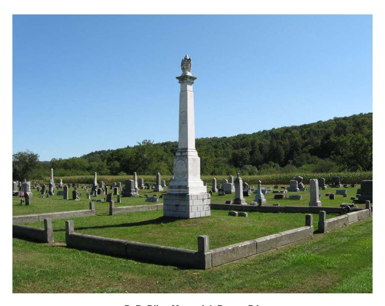
P. P. Bliss Memorial, Rome, PA Dedicated July 10, 1877