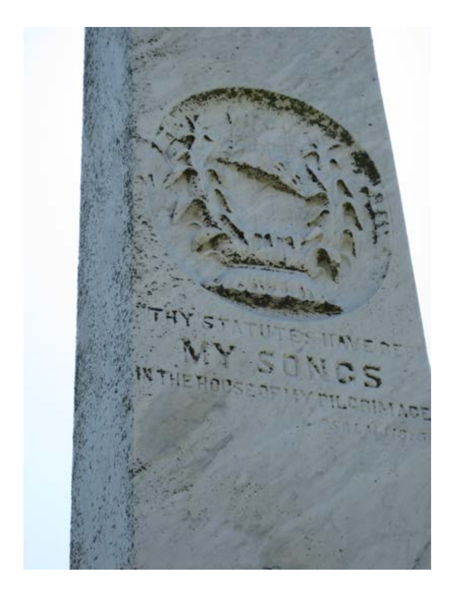
FRONT OF MONUMENT ON SPIRE

THY STATUTES HAVE BEEN MY SONGS IN THE HOUSE OF MY PILGRIMAGE. PSALM 119:54